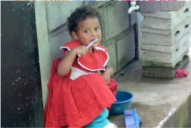
CENTRAL AMERICAN VILLAGES